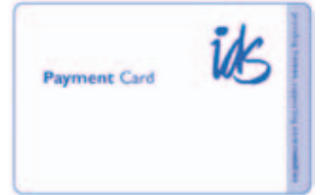
The new IDS rent card

The new system allows us to replace lost or stolen rent cards much faster so, if you need a replacement card, please contact Head Office.