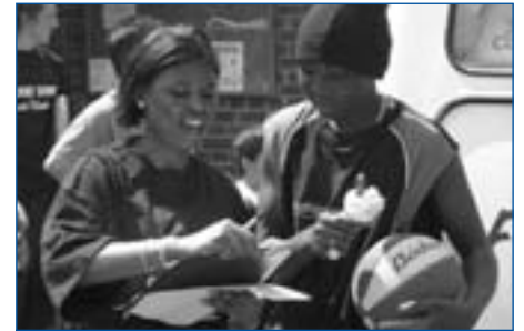
Volunteers from Skinners School carrying out a survey at the Sports Day

Two further days are planned on Tuesday 5th and Wednesday 6th August. The days are open to anyone, with cricket, football, tennis and basketball all on offer.