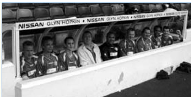
Six-a-side football squad from IDS that took part in a charity tournament at White Hart Lane (Tottenham Hotspurs Ground) in May

The aim of the tournament was to raise funds for Maccabi UK and other charities. The Maccabi Union is a worldwide organisation whose aims are to promote the active participation in sports and education of young Jewish men and women, in order to enhance their Jewish identity, values and commitment to the community.